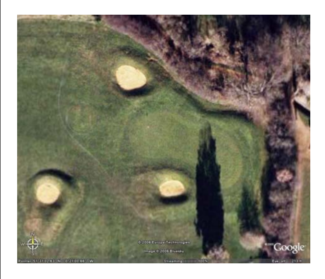
Last newsletter's "Name that green" answer: It was the 17th!

Name the Brent Valley green pictured below.