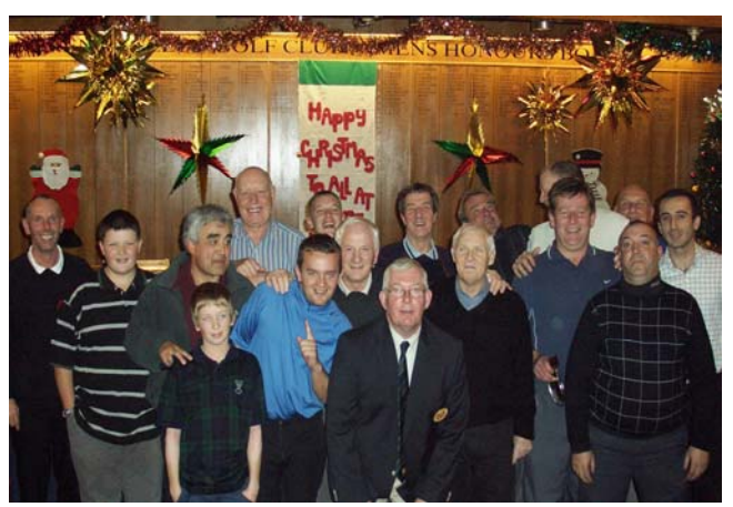
The mens winners at the annual prize giving ceremony on December 3